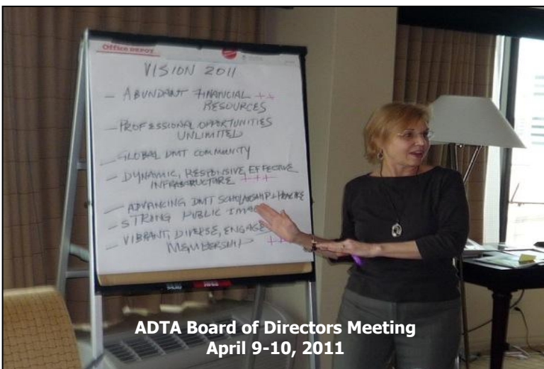
ADTA Board of Directors Meeting April 9-10, 2011